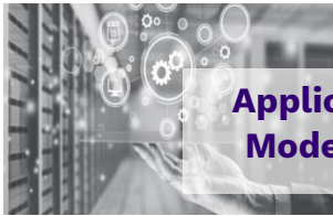
Application & IT Modernization

Advances from the cloud, edge computing and colocation and hosting services, combined with the rise of remote work, new security threats and the onset of artificial intelligence, are transforming enterprise data centers. The innovators whose technology runs those environments have a critical role to play in supporting their customers and empowering their success.