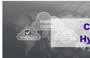
Cloud & Hybrid IT