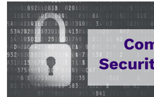
Compliance, Security, & Privacy

CDS and its new Raytrix MVS platform provide certainty and predictability through comprehensive support services to enterprises whose success depend on the performance, reliability, security and efficiency of their infrastructures.